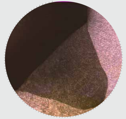
/ Perfect root and leg penetration

* A SB60i or a wire buffer is necessary for these processes