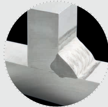
/ Optimal weld face profile and toe transition